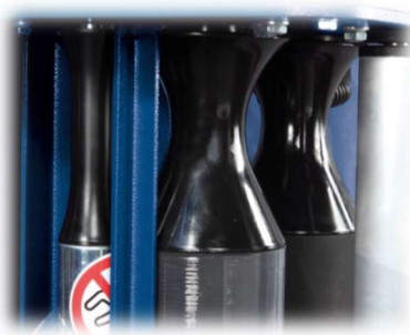
LAYOUT MASTERWRAP HD [inch]

The PGS film carriage is fixed gear 250% power pre-stretch and the force to load (tension) is controlled by a strain gauge, adjusted on the control panel.